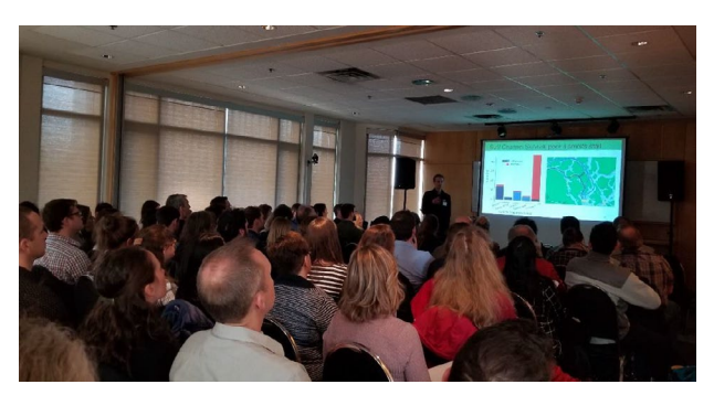
Figure 4. Annual workshops on Pacific salmon migration biology are held at the University of British Columbia, where researchers share findings with diverse knowledge holders and users while brainstorming future research needs and developing new projects.

The Asian carp invasion currently plaguing the Mississippi Basin continues to threaten the Laurentian Great Lakes through artificial connections between Lake Michigan and the waterways where invasive carp populations are established (Mandrak and Cudmore 2004). Early risk assessments